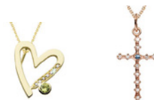
KTERÁ JE PŘÍSTAVEM LÁSKY, VÍRY A NADĚJE