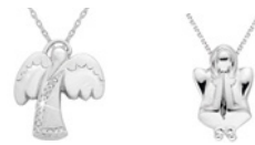
KTERÁ JE ANDĚLEM