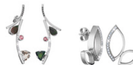
KTERÁ JE ODVÁŽNÁ A KRÁSÁ