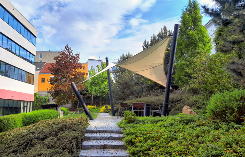
Budova G building