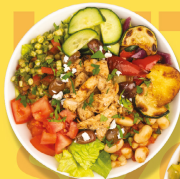
Lemon Chicken Salad