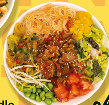
Yamasa Noodle Bowl